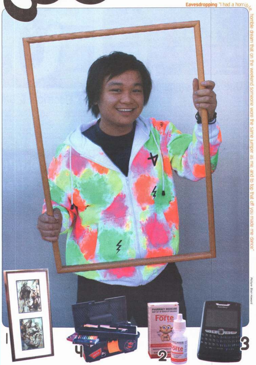
Eavesdropping "I had a horrible horrible dream that on the weekend someone wore the same jumper as me, and to top that off you made me dance"